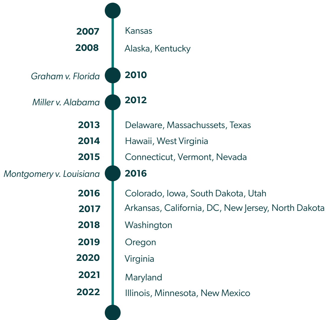
Figure 1. Chronology of State JLWOP Bans

The Supreme Court's rulings propelled a growing number of states to ban JLWOP sentences altogether, reflecting a significant shift in precedent and interpretation of the Eighth Amendment's protection against cruel and unusual punishments. 13 As depicted in Figure 1, only three states had excluded individuals under 18 from receiving parole-ineligible life sentences when Miller was decided: Alaska, Kansas, and Kentucky. After the Miller ruling, an additional nine states banned JLWOP: Connecticut, Delaware, Hawaii, Massachusetts, Nevada, Texas, Vermont, West Virginia, and Wyoming. After the court's Montgomery v. Louisiana ruling in 2016, an additional 16 states and the District of Columbia banned JLWOP. 14 This brought the total of states that ban LWOP for juveniles to