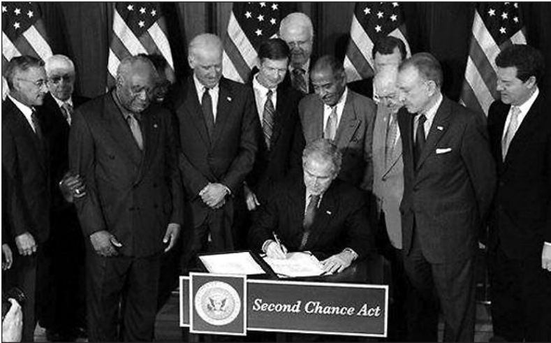
President Bush signs the Second Chance Act.

President George W. Bush signed the Second Chance Act in April, authorizing more than $300 million to expand assistance for people currently incarcerated, those returning to their communities after incarceration, and children with parents in prison.